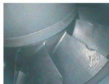
Chip in Turbine Blade